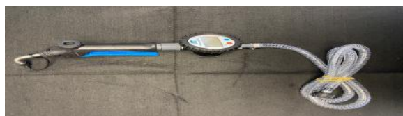
Metergun Assembly PN# BP-MG ( STD ) PN# BP-MGHV ( HV )