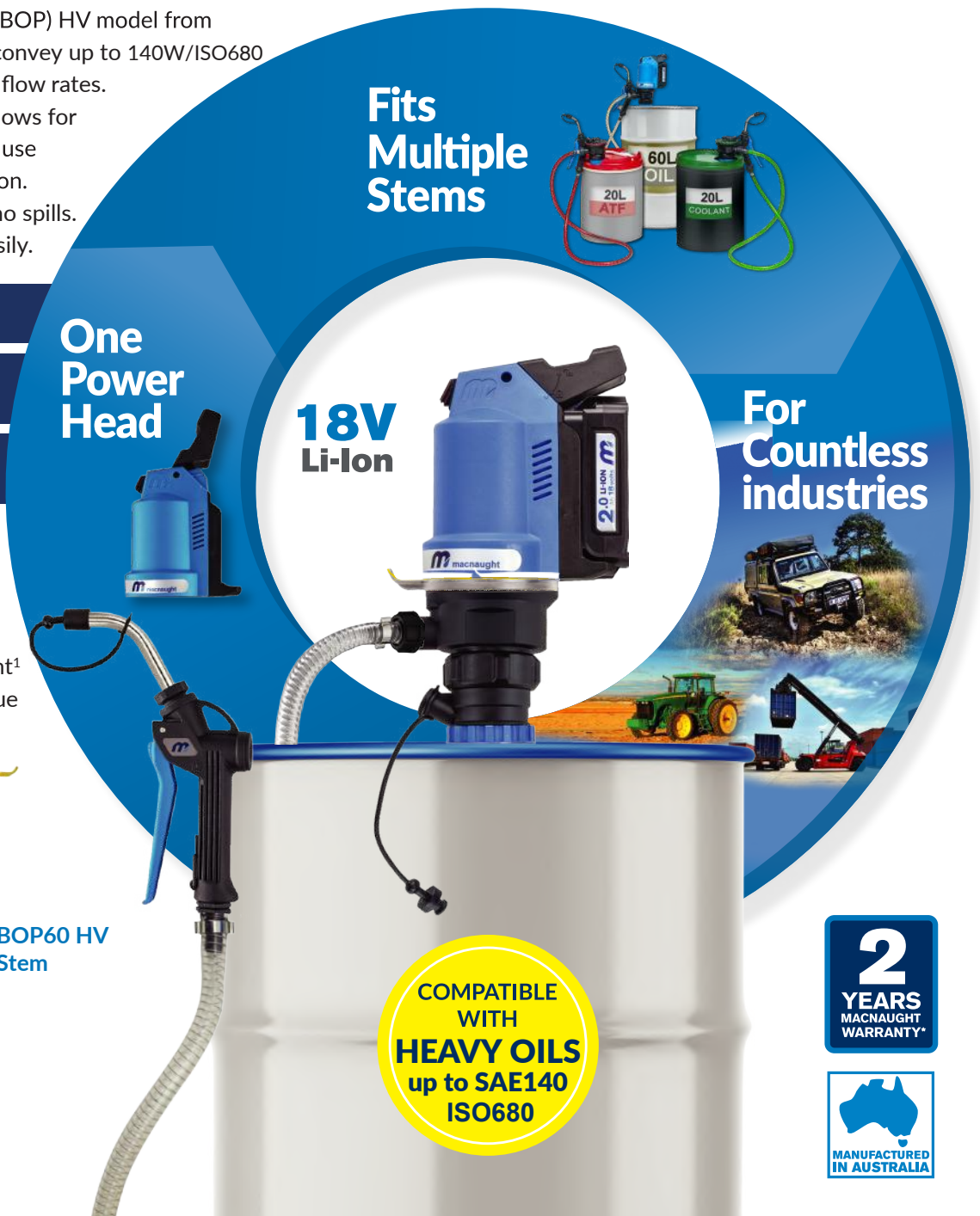
BOP20 HV Stem shown with Powerhead

BOP20HV & BOP60HV Kits come complete with everything you need to pump oil. Add a Stem for additional oils, ATF 1 or Coolant 1 BOPHV stems include a unique yellow gun hook for easy identification.